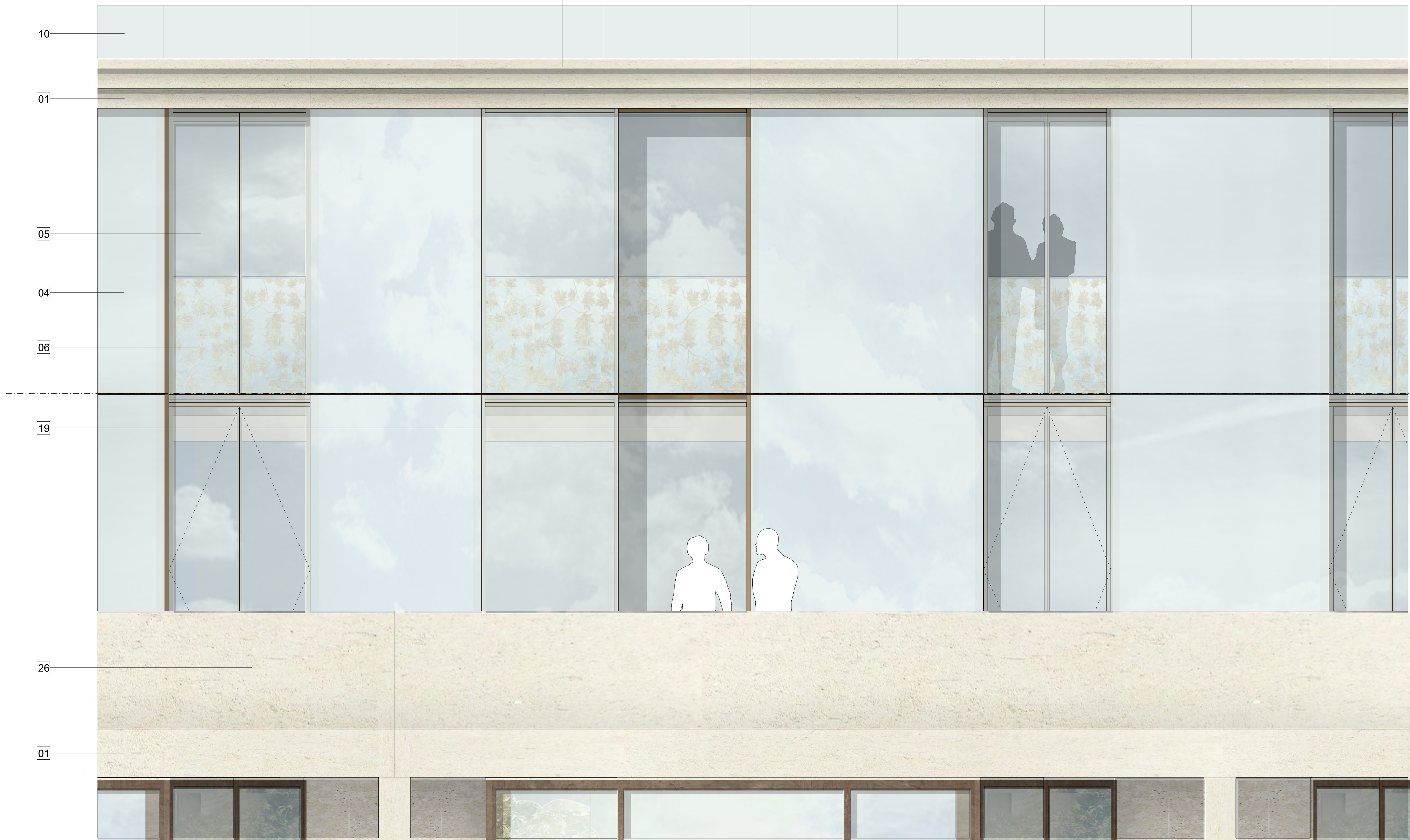
G251 5301-1 Detail Elevation